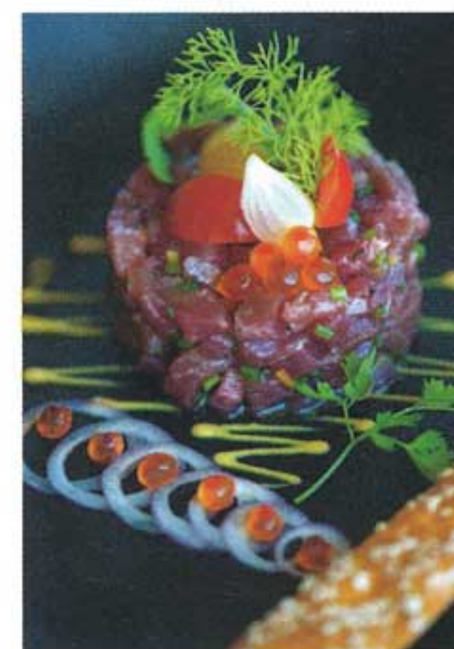
FROM TOP: Arrive in style via seaplane; Atmosphere Kanifushi offers a range of fine dining; Sunset Pool Villas have their own private swimming pool

Kanifushi is just one of Atmosphere Hotels & Resorts luxurious offerings. The brand is continuing to pioneer value for money vacations in the Maldives and is excited to introduce OBLU Select at Sangeli in the North Malé Atoll from July 2018. *