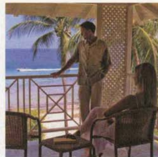
A one-bedroom deluxe beachfront room in the newly-opened Almond Beach Resort

Facilities include a kids' club, a range of activities for young adults aged 12 to 16, the Maldives' ▶