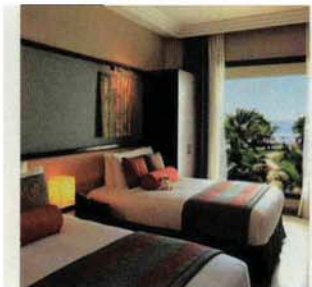
These pages, clockwise from top left: two watery scenes in JA Resorts' Palm Tree Court in Dubai; an InterContinental, Mauritius bedroom, and the Jewel Paradise Cove Beach in Jamaica (right) and Breathless Punta Cana Resort & Spa in the Dominican Republic (left)